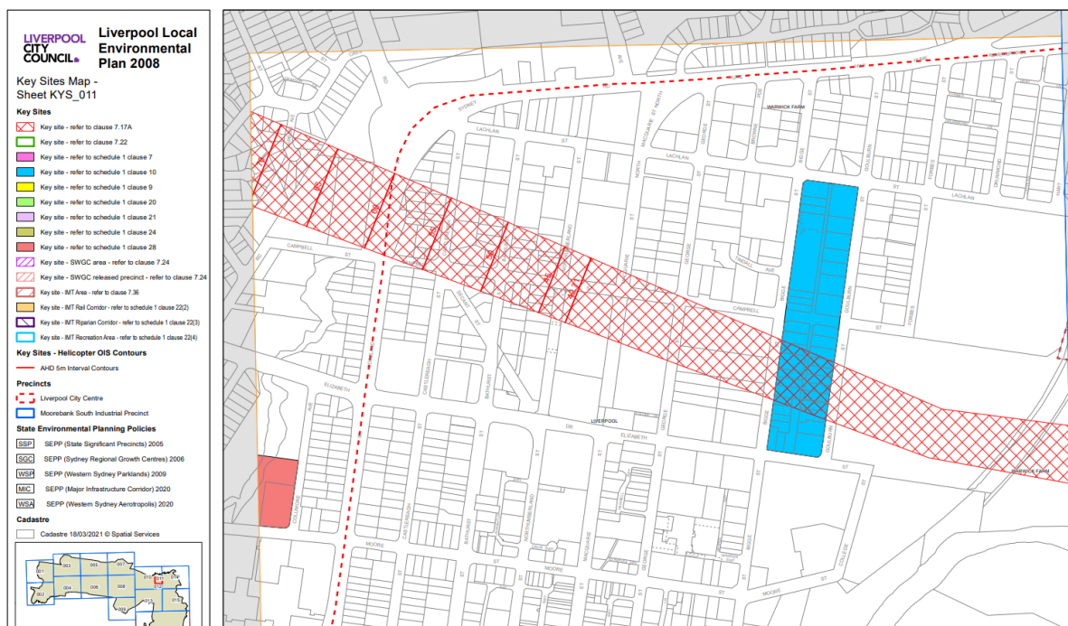
Figure 3: Extract of Key Sites Map KYS_011 (if supported two other map tiles will need to be amended being KYS_010 and KYS_014)

The planning proposal has been drafted as required by the above Council resolution (see Attachment 1 ).